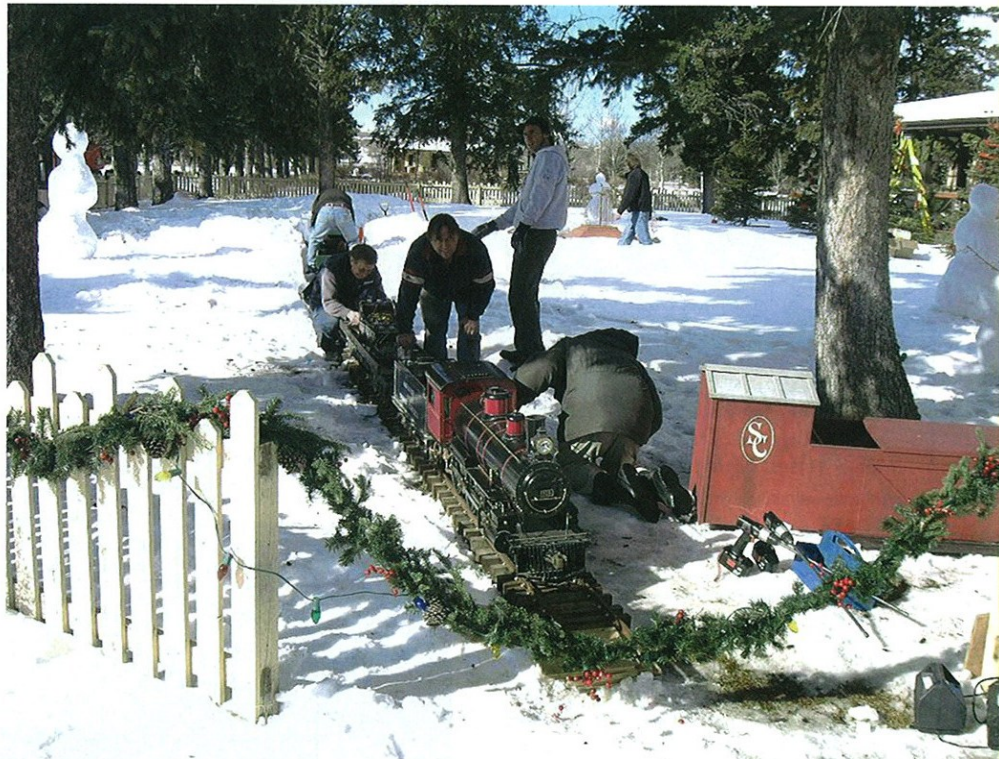
1 Delivering the track and rolling stock.

Day 4 was spent taking the railroad apart and returning the track, locomotive, and cars back to their home at Iron Horse Park in Airdrie, Alberta. Although it proved to be a fair amount of work, it was