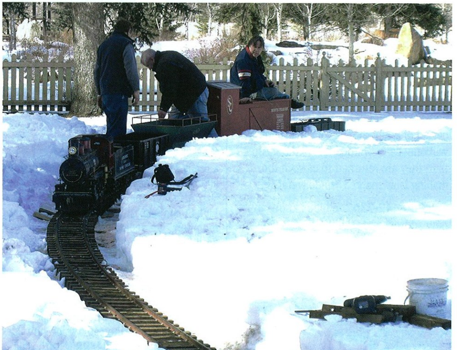
2 Leveling and testing the track.