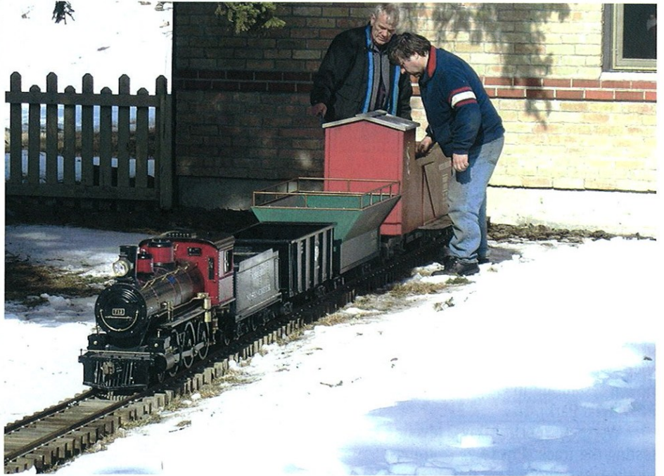
4 Ready for ACTION!

a really fun and educational experience for all club members who participated.