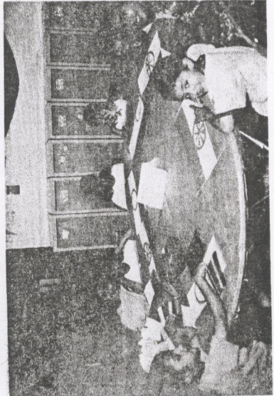
Kids are preparing the Indian Flag in their Craft Class