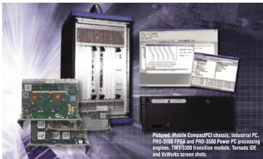
Pictured: Mobile CompactPCI chassis, industrial PC, PRO-3100 FPGA and PRO-3500 Power PC processing engines, TM1-3300 transition module, Tornado IDE and VxWorks screen shots.

Spectrum Signal Processing #200-2700 Production Way Burnaby, BC V5A 4X1 Canada Tel: 604-421-5422 Fax: 604-421-1764 Website: www.spectrumsignal.com