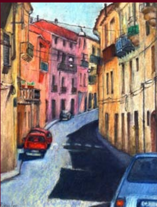
Painting by Beth Politano