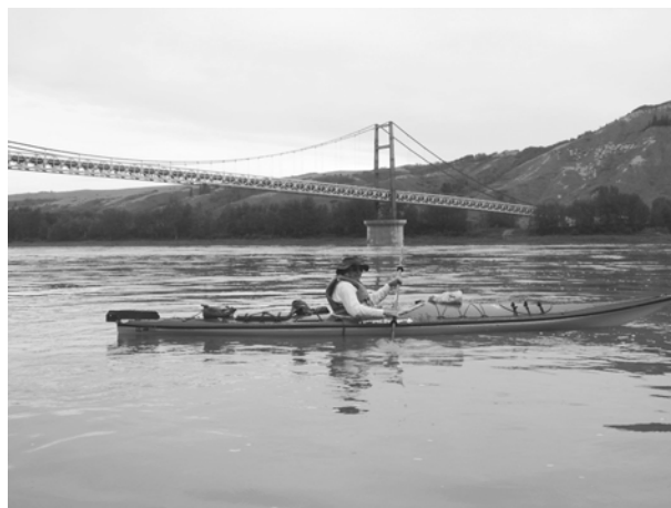
Dunvegan Bridge, July 2002