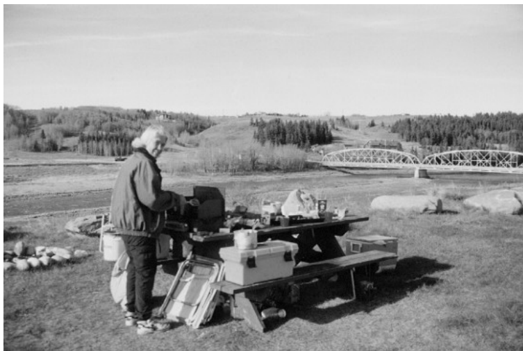
Cochrane’s Riversedge campground with River Avenue bridge in the background, May ‘99

Louise Shotton Shuttle Service: 403.282.5071 Bow River Shuttles: 403.278.9165 Calgary Bow River Shuttle Service: 403.510.0138