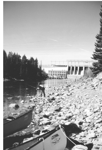
below Ghost Dam, mid-May '99