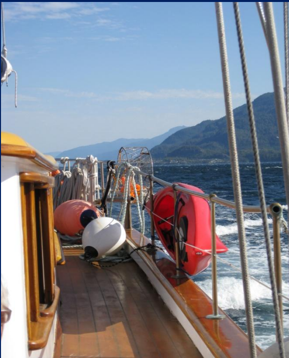
Sailing the Broughton Archipelago

2011 closes out with many wonderful memories and preparations are underway to create more in the New Year. My two Tuscany painting holidays are full so I will be spending a whole month in that part of the world in April/May sharing my enthusiasm for travel and art with like-minded friends. My next sailing trip “Whales and Totems” onboard the Maple Leaf schooner is coming up in August and I urge anyone interested to sign up soon as we only take 8 passengers.