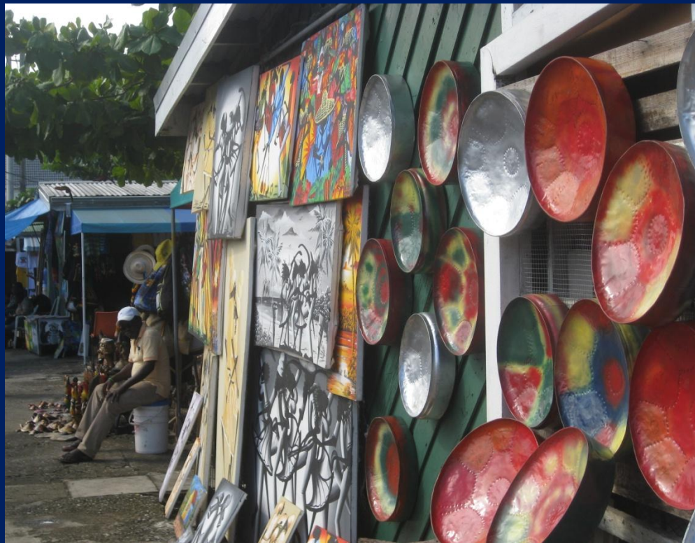
the island beat – steel drums

The Caribbean cruise was a fun experience. Our ports of call were the Bahamas, Jamaica, Grand Cayman and Cozumel. Not being much into shopping, we liked Ochos Rios/Jamaica the best as we found it to be the most authentic experience in terms of how people there live. Yes, there is great poverty but also joy and pride. A guide introduced us to some hidden places, the island's unique vegetation and culture. Local markets have wonderful crafts on display, ideal subjects for great photos and inspiration for future artwork.