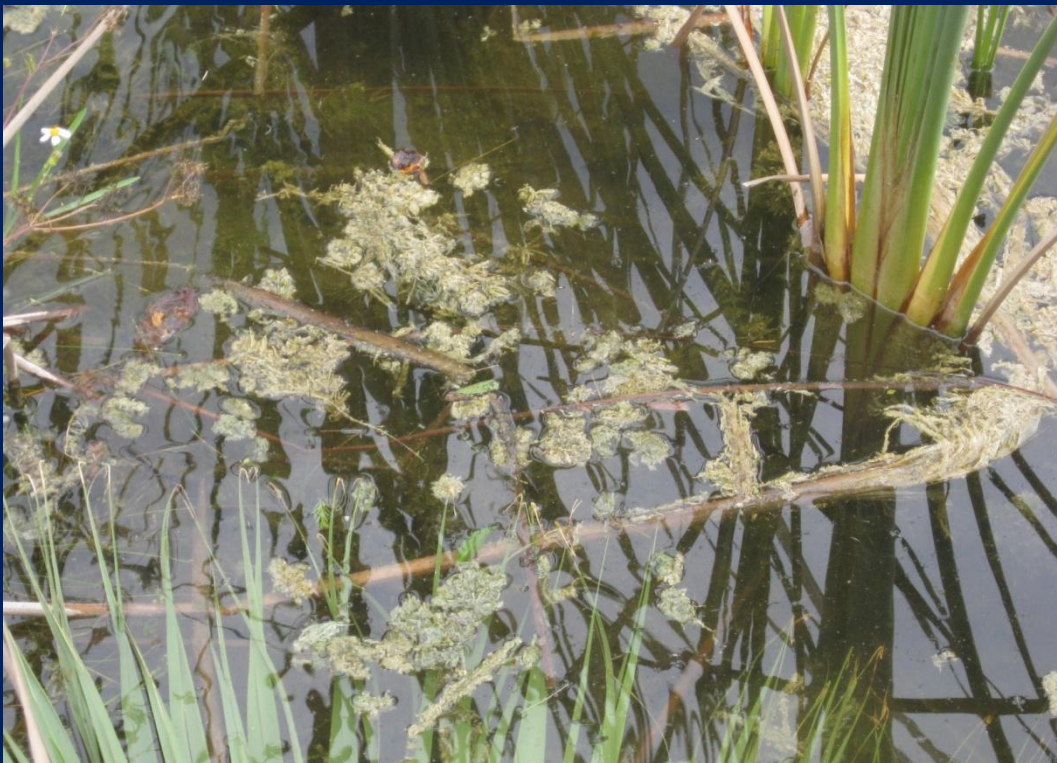
and lush vegetation