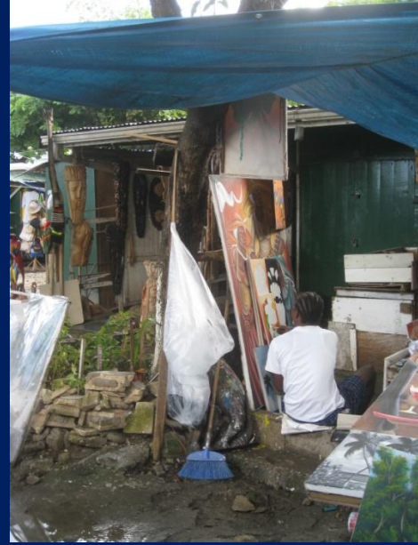
Fellow artist at work

One of the most fascinating things were Ocho Rios' telephone posts and wires. The little clumps were hummingbird nest! How neat is that!