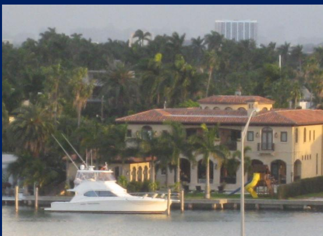
This is the life, eh?