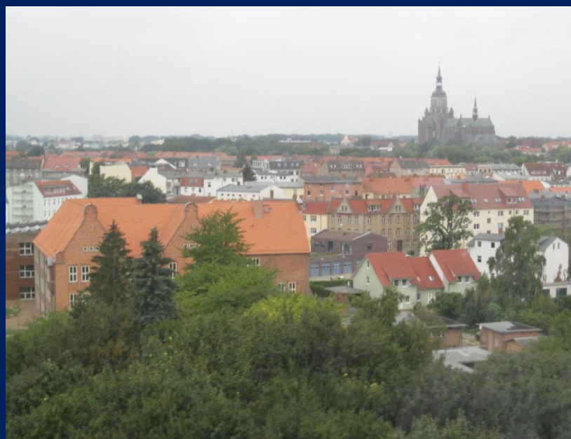
Idyllic spots along the German Baltic Coast