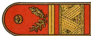
Major General - Vezérőrnagy