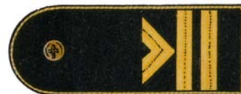
First Lieutenant - Főhadnagy