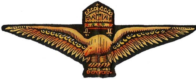
Pilot's Qualification Badge (left)