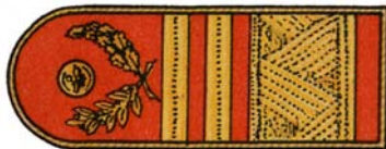
Lieutenant Field-Marshal - Altábornagy