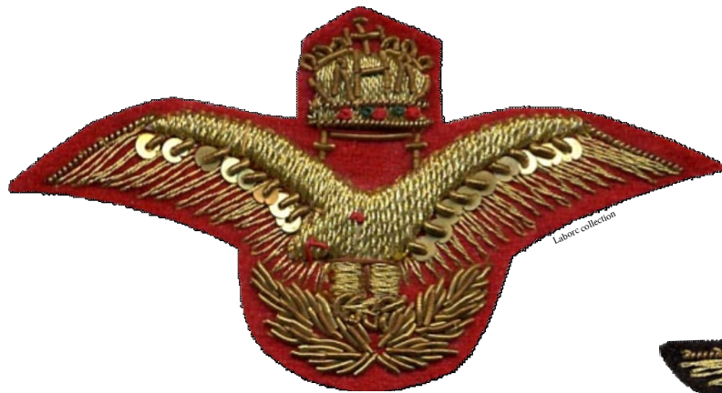
Above - the general's cap badge.

Below is the insignia worn by Leaders of the Air Ministry. It was sewn above the right breast pocket.