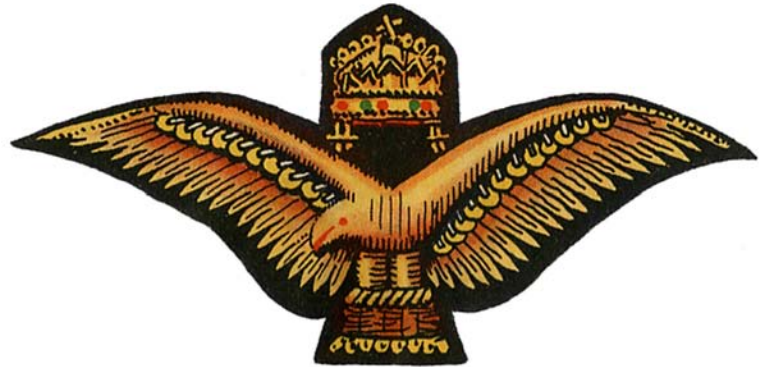
Officer's Cap Badge (below)

The pilot's badge and officer's cap badge are seen here in the actual size and colour from the original poster. It's clear why they are often confused. The NCO's cap badge is identical to the officer's but embroidered in silver rather than gold - another common misconception is that the pilot's badge also came in a silver version - which was never the case.