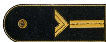
Warrant Officer - Zászlós