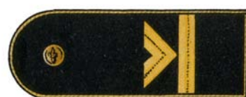
Lieutenant - Hadnagy