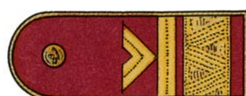
Technical Admin. Officer - Repülő műszaki tisztviselő (cherry-red wool)