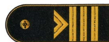
Captain - Százados