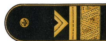
Major - Őrnagy