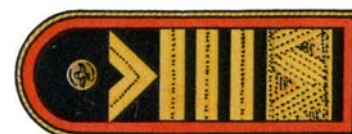
General Staff Colonel - Vezérkari ezredes