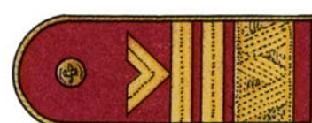
Aviation Engineer - Repülő mérnök (cherry-red velvet)