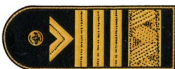
Colonel - Ezredes