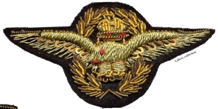
Left - the officer's cap badge.

Below is the insignia worn by Leaders of the Air Ministry. It was sewn above the right breast pocket.