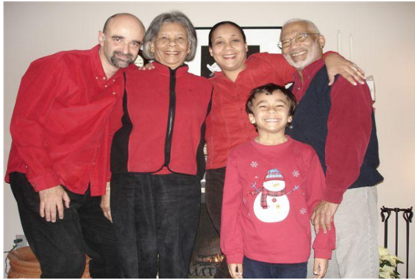
4 Martins and a Sukunda celebrate Christmas 2008! (left)