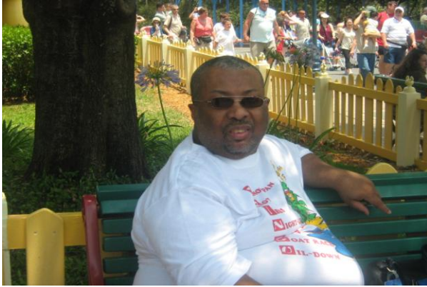
- Roj (6th) yours truly taking a little break from taking pictures and enjoying the surroundings.