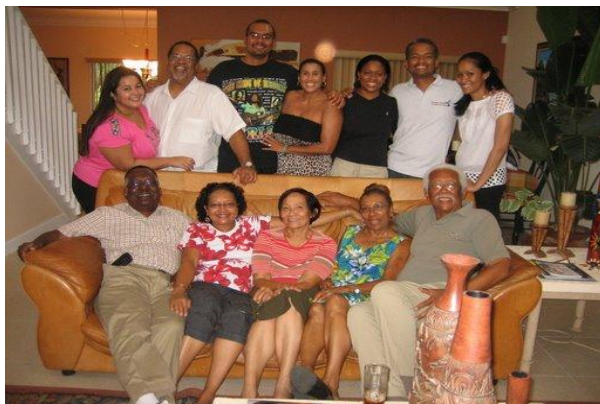
Headley Family Reunion 2009 in Homestead, Florida.