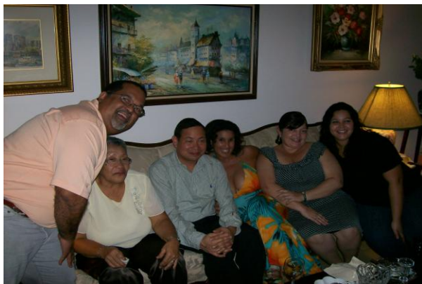
Lee-Young's & Headley's in Miami