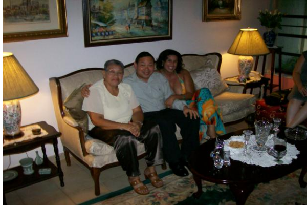
Mini Miami Family Reunion