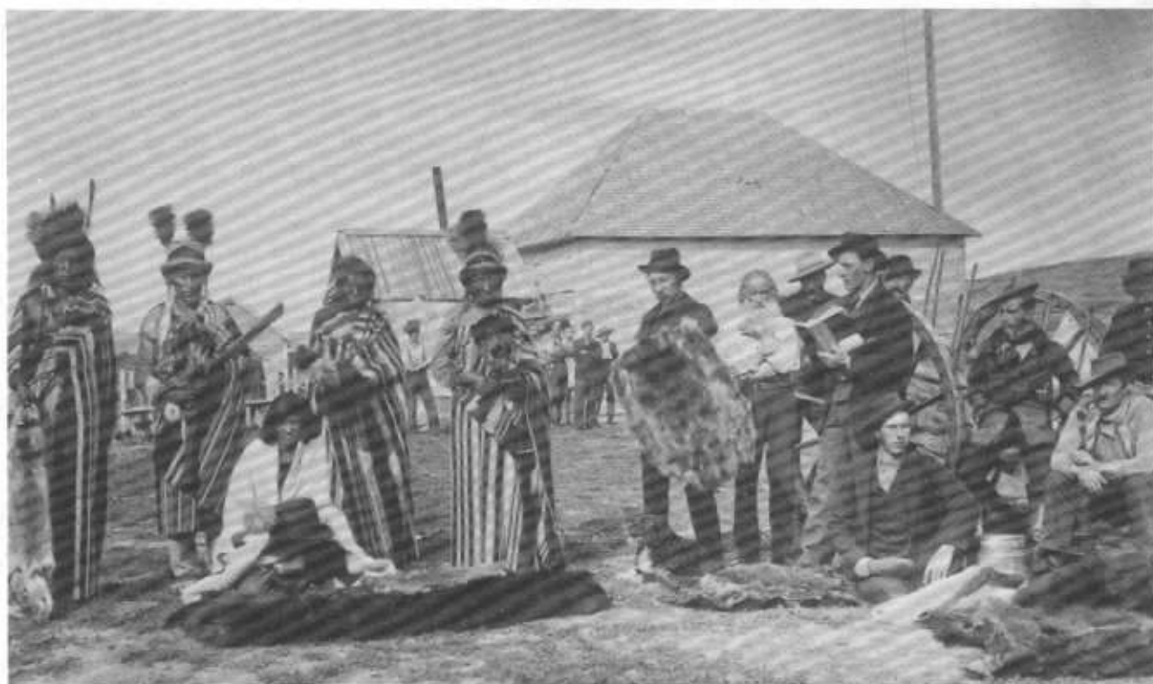
In happier days, Big Bear (the Indian on the right) traded furs at Fort Pitt.