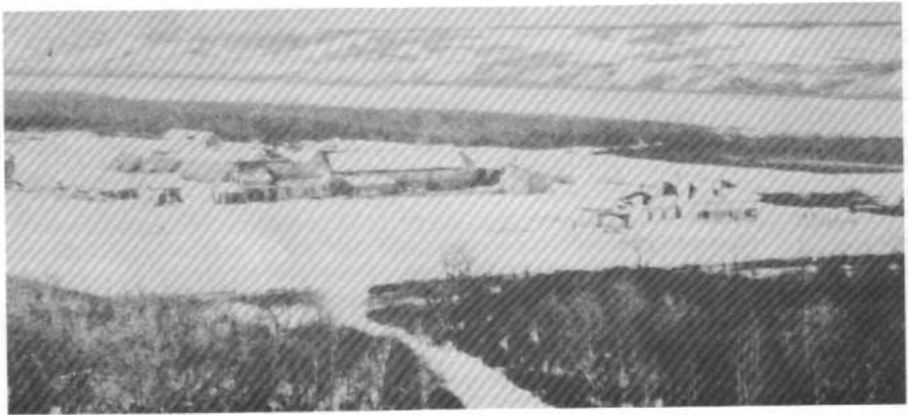
Fort Carlton in 1885 before the outbreak of the Resistance.