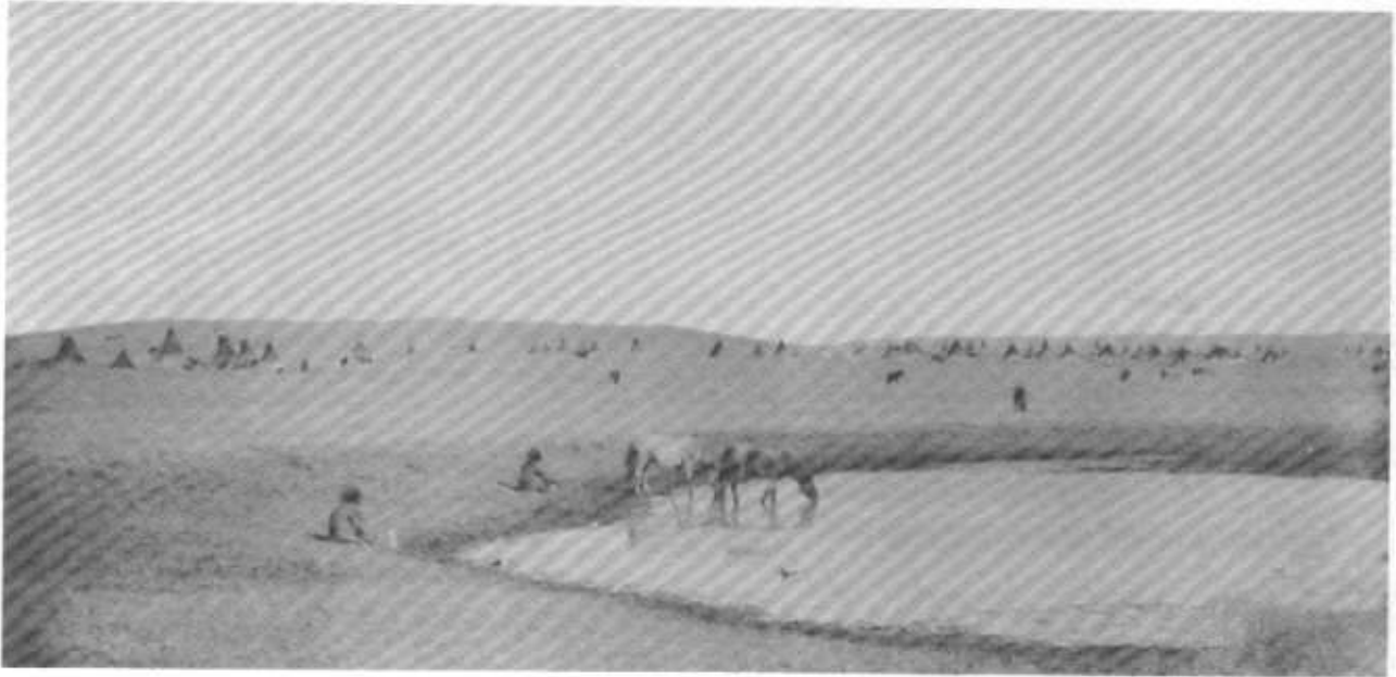
Big Bear's Camp in 1883 - on the verge of starvation.

many of these in the most rotten and dilapidated condition. ... Their clothing for the most part was miserable and scanty in the extreme. I saw little children at this inclement season, snow having fallen, who had scarcely rags to cover them. Of food they possessed little or none; some were represented to me as absolutely starving and their appearance confirmed the report made of their condition. ... It would indeed be difficult to exaggerate their extreme wretchedness and need, or the urgent necessity which exists for some prompt and sufficient provisions being made for them by the Government. 15